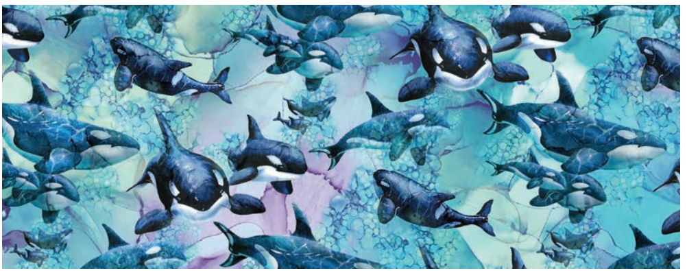
DP24982-44 Whales-Blue Multi