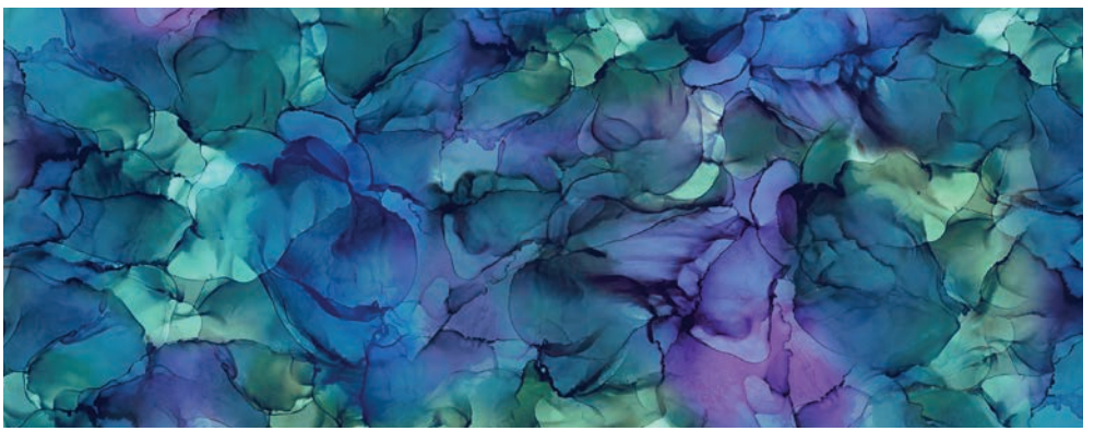
DP24987-44 Water Texture-Blue Multi