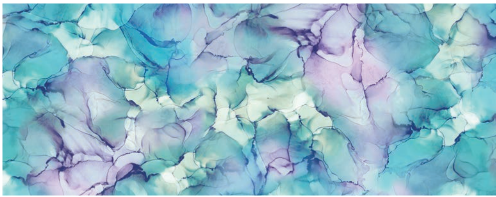
DP24987-62 Water Texture-Teal Multi